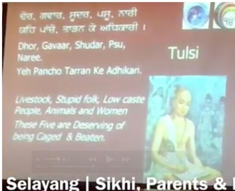
Fig 2: Couplet from Tulsi Das Ramayana

It is UNFORTUNATE that NOT KNOWING ENOUGH about ANOTHER FAITH Karminder MISINTERPRETS verses in the Tulsi Das Ramayana, a sacred scripture of the Hindu faith. Karminder lists the couplet (see slide Fig 2) as follows.